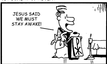
1ST SUNDAY OF ADVENT

This year, the fish fry will be December 2 at the Long Grove Civic Center. We will have door prizes and start serving at 4:00 p.m. The fish fry is sponsored by the Long Grove Lions Club.