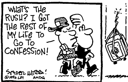
25 th SUNDAY IN ORDINARY TIME